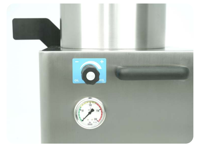
Speed control & pressure gauge.