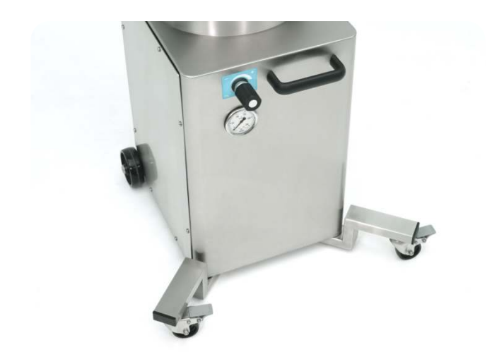
4 wheel option: adding 2 swivel casters on anti-tilt extensions, with brakes.