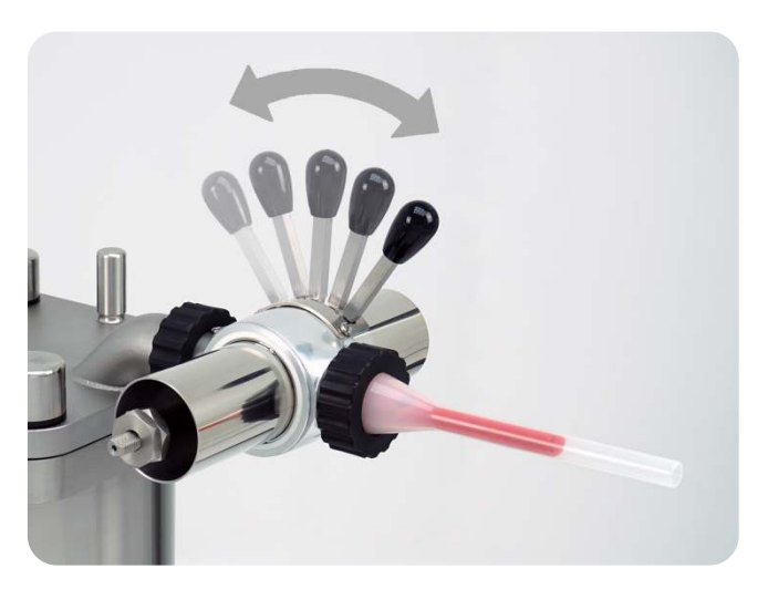
Manual Portion Head PF500, portions from approx. 20 to 500 grams.