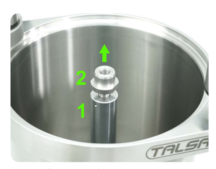
Cylinder shaft in stainless steel. Replaceable shaft top.