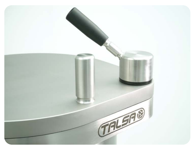
Removable lid, adjustable lid lock nuts with handles.