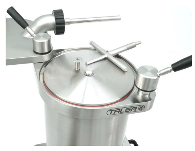
Easily removable piston, new s/s piston extraction wrench included.