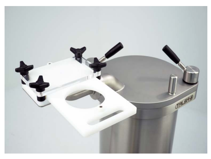
Hamburger patty former HF1. Different sizes (thickness/diameter) available.