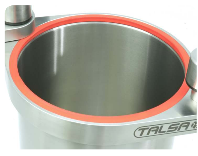
New lid and piston seals of low wear and long life.