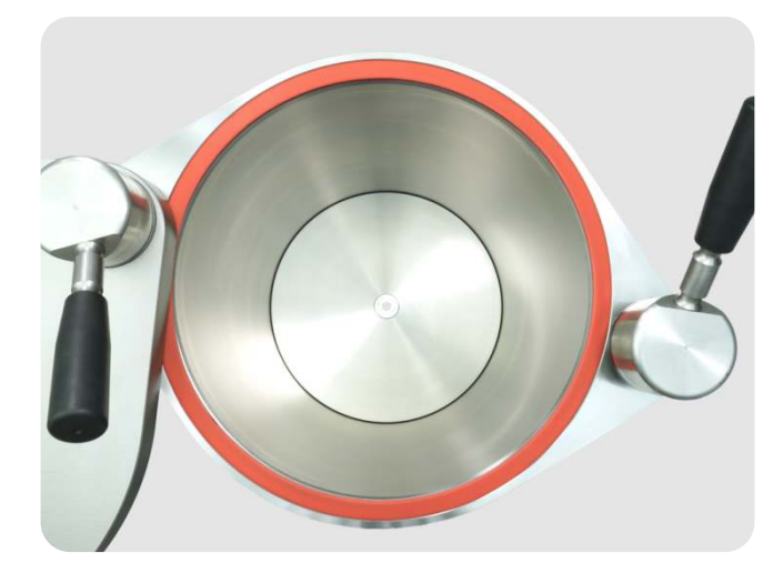
Round, machined barrel, internally polished: precise internal diameter and sealing.