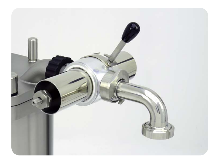
Curved nozzel to fill cans with Portion Head PF500.