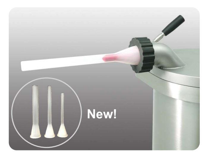
Standard equipment 3 transparent nozzles. Without edges, maximum hygiene. ø ext. 14, 20 and 30mm.