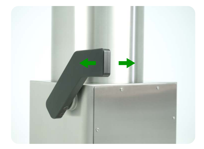
Ergonomic knee lever. Reversable operating direction.