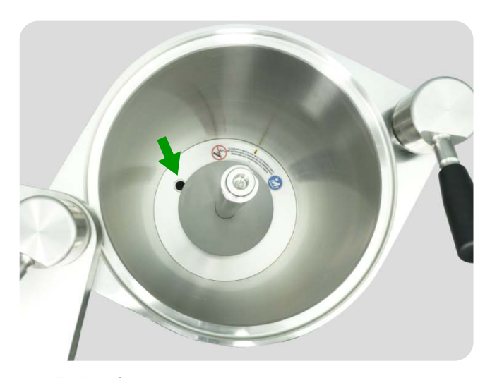
Fully s/s barrel bottom with water draining outlet. Simple cleaning.