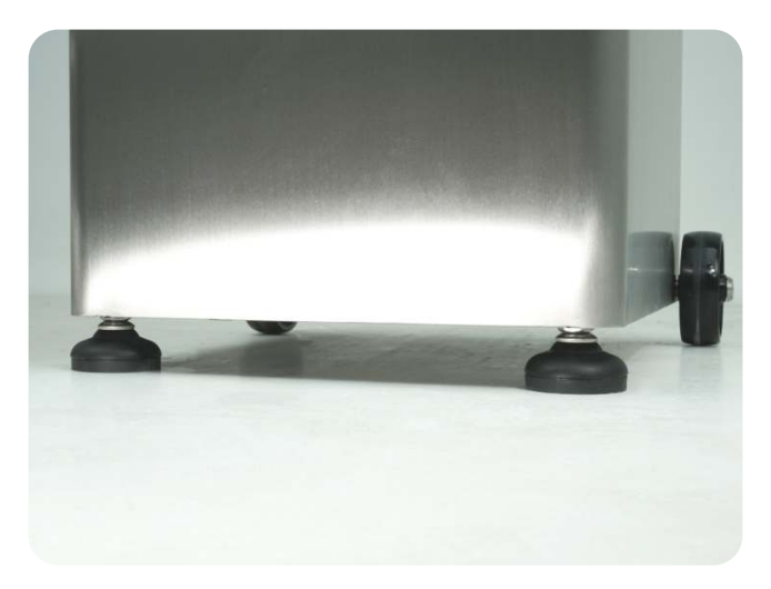
Adjustable anti-vibration feet.