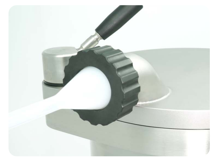
Advanced nozzel/horn nut. Soft closing and improved sealing.