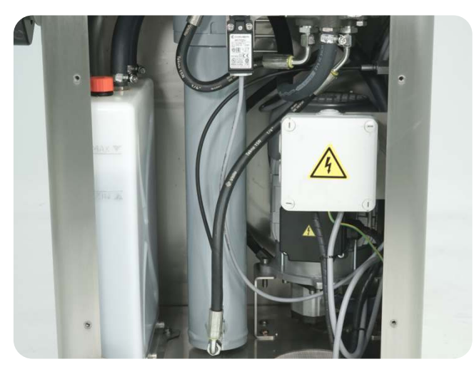
Powerful hydraulic system. Transparent oil reservoir, completely independent.