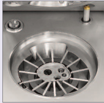
Vane cell feed system